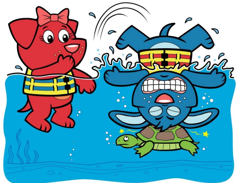
RIGHT INSIDE WINDOW

NEVER, EVER DIVE!!! There may be something you can't see!