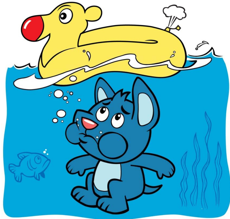
LIFT INSIDE WINDOW

That's not a Life Jacket, Sinker! Blow up toys can lose their air and they can get away from you.